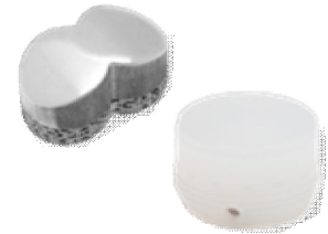
Figure 2. (top) Humeral Implant (bottom) Ulnar Implant

The CUE was developed as a treatment for MCD for dogs in which arthroscopic treatment and the nonsurgical options are no longer successful. By focusing on the specific area of disease (the medial compartment), the CUE implant provides a less invasive, bone-sparing option for resurfacing the bone-on-bone medial compartment, while preserving the dog’s own “good” cartilage in the lateral compartment. This medial resurfacing procedure reduces or eliminates the pain and lameness that was caused by the bone-on-bone grinding.