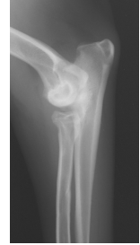
Figure 1. Elbow X-Ray

While these disorders involve different areas of the elbow joint of affected dogs, they all result from abnormal development of the bone and cartilage of the elbow and lead to osteoarthritis. Elbow dysplasia is the most common cause of forelimb lameness in dogs. The abnormalities start to occur when the puppy is going through a rapid growth phase (typically 4-10 months of age), but often the symptoms are not noticed until the dog is much older. Changes in activity level, limping, swollen elbows, pain in the elbows, decreased performance, and behavioral changes are some of the visual signs you may observe if your dog has elbow dysplasia.